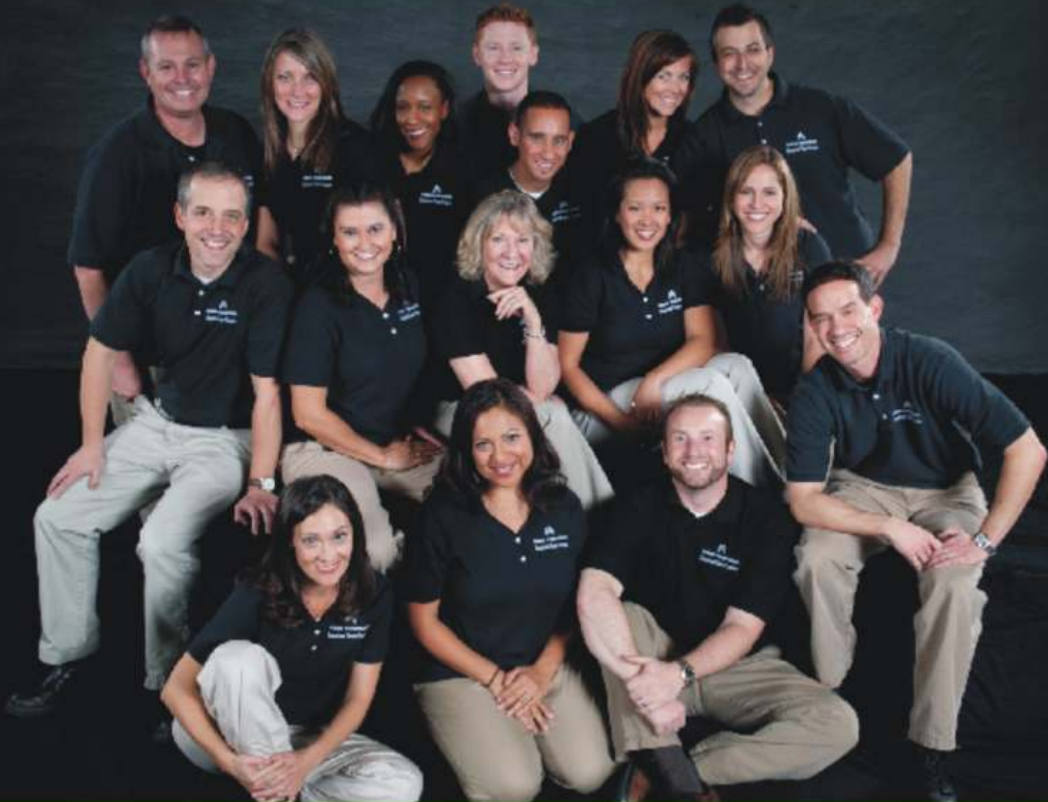
Kaiser Permanente's Educational Theatre Program Staff